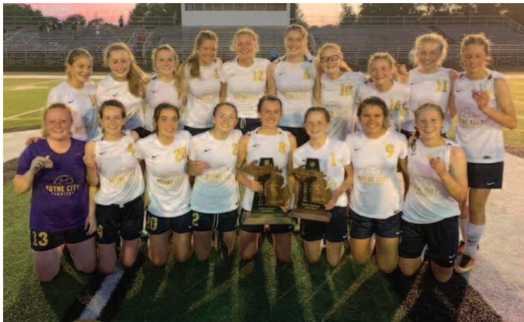
The Boyne City girls soccer team pose with the Division 3 district and regional titles, following their shootout victory over Freeland.

In the shootout, both the Ramblers and Falcons managed to connect on 3-of-5 shots, forcing the game to a sudden death format with each team trading shots until